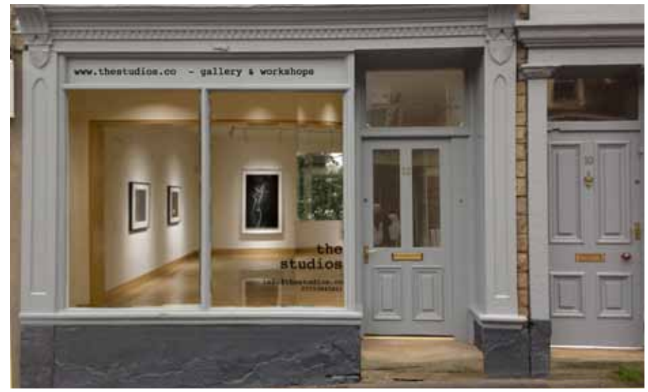
New Mills' The Studios