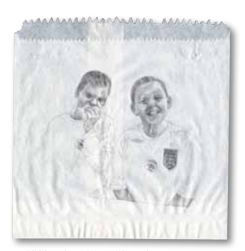
Exhibition pieces by: Beatrice Haines

Derbyshire Open Arts weekend (24th-26th May) and runs from 17th May to 1st June. The fortnight is a chance for grassroots artists to show their work alongside more established practitioners. The Festival has been created by practicing artists themselves, who are all passionate about using contemporary arts to raise the profile of New Mills, with all the social and economic benefits that can bring.